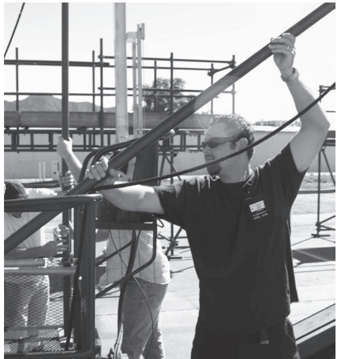
Grip during a rigging class.

There are many justifications for classes. Professionalism should be the main reason. Hollywood is where pinnacle of the movie making machine and the crafts people who work on these movie are the best in the world.